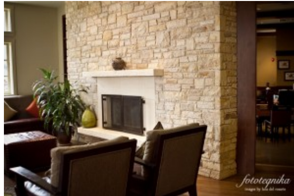
Lobby at Hotel Munras

Monterey is one of my favorite places on earth. There is so much to see, do and eat in this precious town. The Casa Munras is situated in the heart of Old Town Monterey. As it's name conjures, it is spanish and hacienda style in ambiance. Esteban's is the in-house restaurant serving tapas and spanish cuisine. Across the inviting warm and cozy lobby, Sano Spa is ready to transform a weary traveler into a relaxed soul.