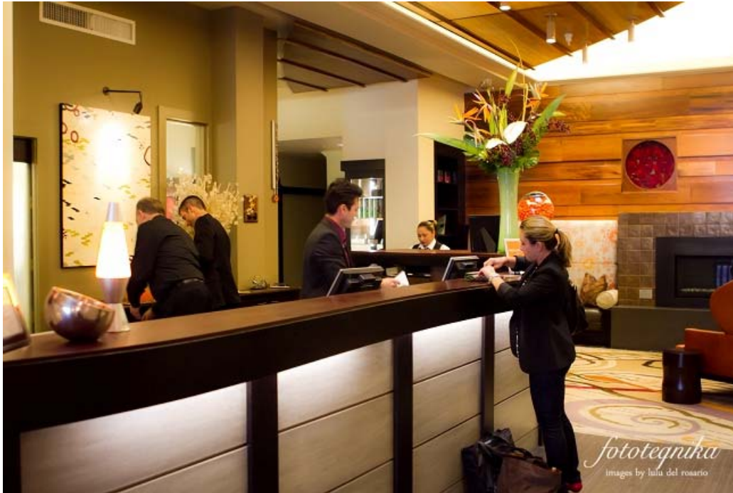
The Hotel Abri's Registration and Lobby