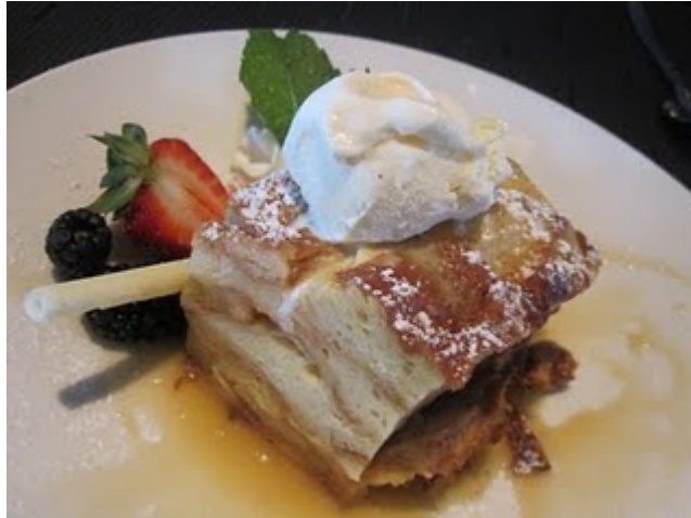
Bread Pudding with Bourbon Caramel Sauce & Vanilla Ice Cream - $4

You also may feel that way with your drinks - Happy Hour offers $4 House Wines, Well Cocktails, and Draft Beers. Seeing a neighbor with a frosted beer mug, I decided on the draft Stella Artois (among the choices of Stella, PBR, and Newcastle) while AP enjoyed a glass of Chardonnay.