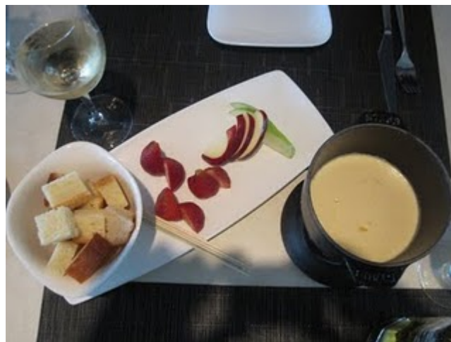
Cheese Fondue with Bread Chunks, Apples, & Strawberries - $6

The Happy Hour menu is pretty cool too - everyday, from 4-7pm - the items on the menu marked with a Martini icon are ½ off. What's even more cool is that it's not just appetizers; the other happy hour eats include Entrees (Marina Fish & Chips - $8 on HH, Fire Grilled Organic Chicken served with Potatoes & Shrimp - $12 on HH, and Pancetta Wrapped Pork Tenderloin - $12 on HH), Sandwiches (Chipotle Gruyere Burger - $7.50 on HH), salads (Blackened Chicken Salad - $7.50 on HH), and my favorite - dessert (Bread Pudding with Bourbon Caramel Sauce & Vanilla Ice Cream for $4!)