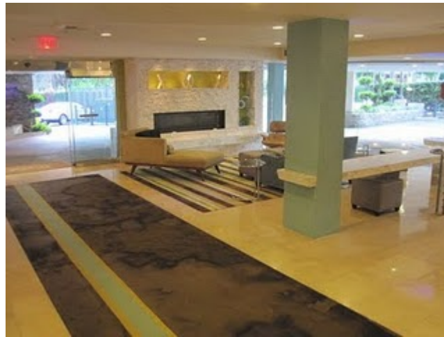
Hotel Belamar Lobby

JG & I do our best to hit Happy Hours all over the wide urban sprawl that is Los Angeles, but one of our biggest challenges is trying to make it to weekday-only Happy Hours that end at 7pm when our typical workdays don't end before 6pm. It almost takes a vacation day for me to make some of these faraway Happy Hours, and it was just that, an early dismissal afternoon, that gave me the opportunity to visit the heretofore un-Toured South Bay area with pal, AP, who was in the area for work training.