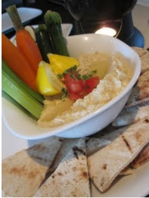
Hummus Bowl with Baby Vegetables & Soft Pita Triangles - $5.50

Being on a Happy Hour Tour and not wanting eat a full dinner, we stuck with Appetizers - Cheese Fondue with Bread Chunks, Apples, & Strawberries for $6 and a Hummus Bowl with Baby Vegetables & Soft Pita Triangles for $5.50. The fondue was kept warm over a tea light burner (very cute!) and was just warm enough to be tasty, but not burn your mouth! The presentation of the hummus with the Baby Vegetables was terrific - you definitely felt like you got your money's worth!