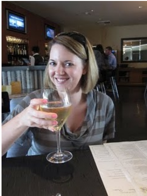
AP & $4 Chardonnay

Being on a Happy Hour Tour and not wanting eat a full dinner, we stuck with Appetizers - Cheese Fondue with Bread Chunks, Apples, & Strawberries for $6 and a Hummus Bowl with Baby Vegetables & Soft Pita Triangles for $5.50. The fondue was kept warm over a tea light burner (very cute!) and was just warm enough to be tasty, but not burn your mouth! The presentation of the hummus with the Baby Vegetables was terrific - you definitely felt like you got your money's worth!