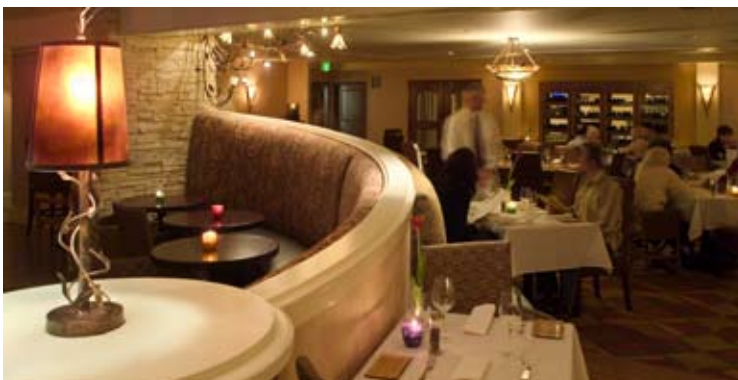
THREE DEGREES RESTAURANT