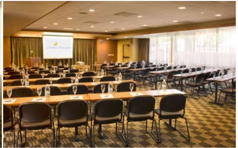
MAINSAIL BALLROOM – MEETING