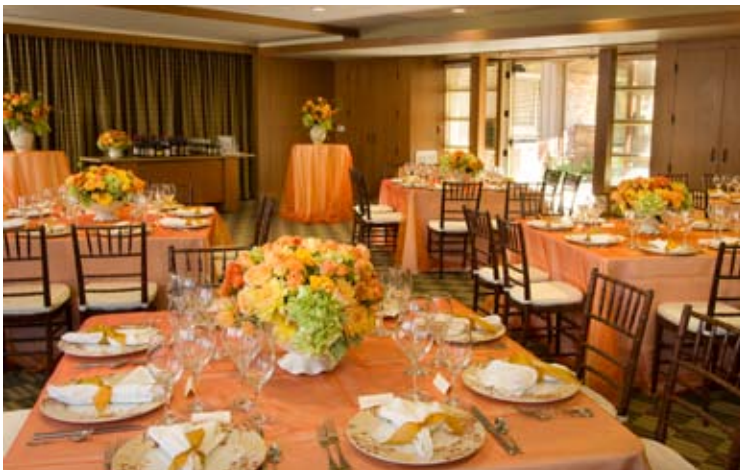
MAINSAIL BALLROOM – RECEPTION